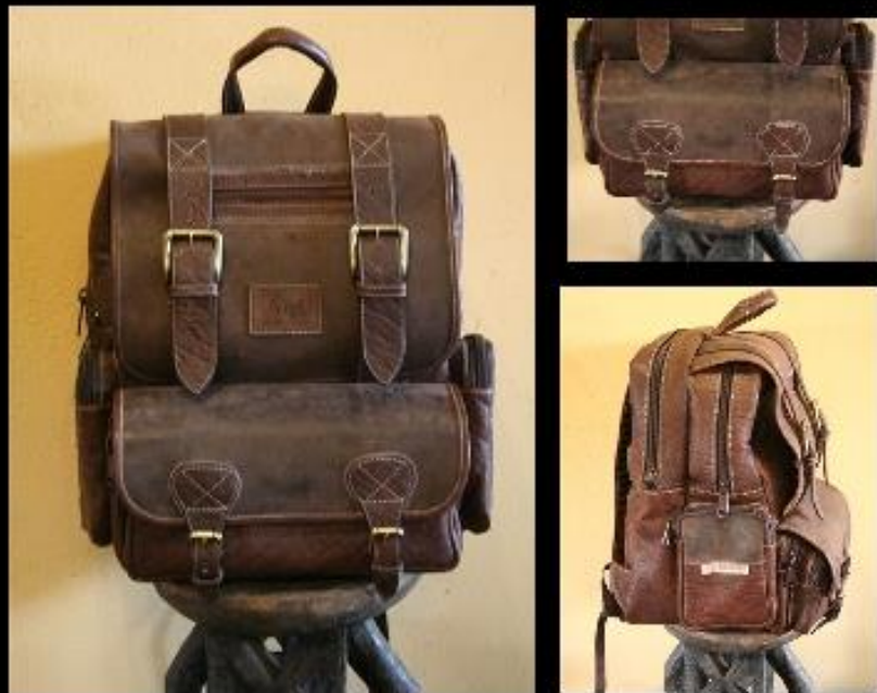
Printed Buffalo & Pull up Bovine