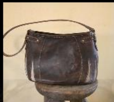
Blue Wildebeest WB

This small compact purse carries a world of character suitable for all occasions.