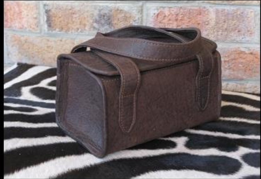
Brown Buffalo Print