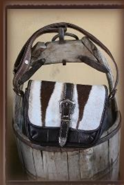
Zebra with Nicotine ZEB