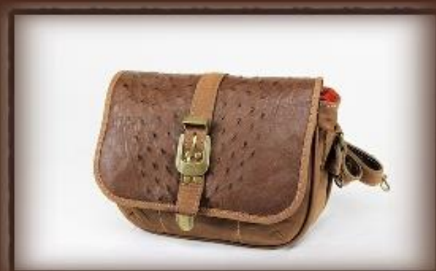
#1 Cow Hide with Chestnut CH