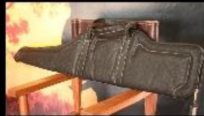
CWA Standard leather CWA-STD-L-01