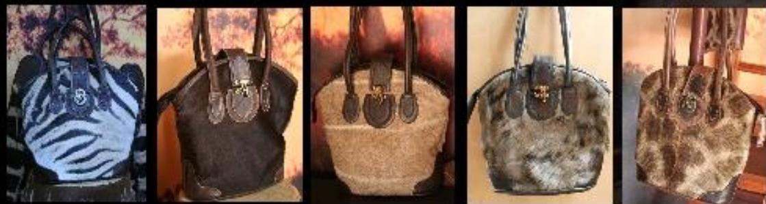
Zebra Sable Kudu Wildebeest Giraffe

Our range of Hillary purses was one of our introductory styles 9 years ago and continues to be one of our most popular bags