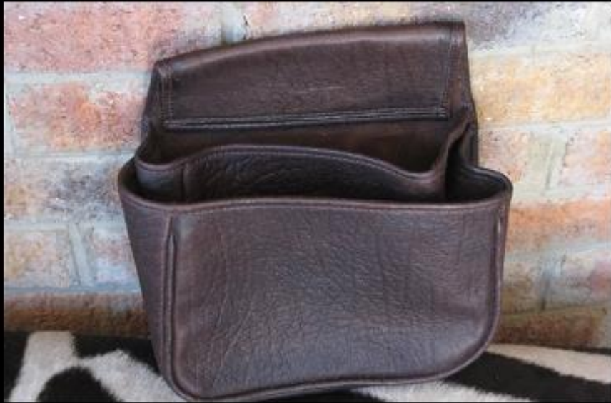
Brown Buffalo Print