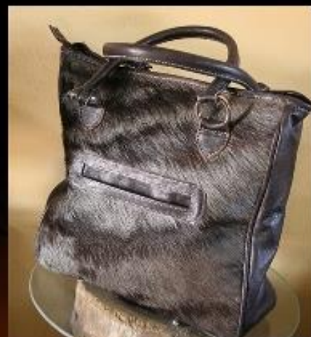
Blue Wildebeest WB