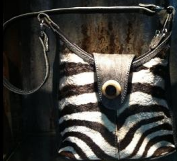
4 Zebra & Charcoal grey leather

This Exquisite composure, brings back to life the true beauty of its origin. Stripes or Rosettes, Black or Brown. One in the same. Think Hatton.