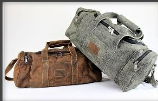
Grey Safari & Cognac