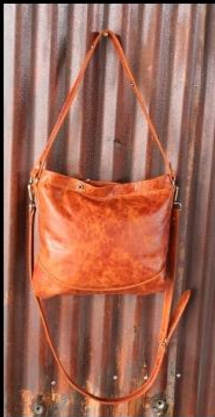
Kerstin Leather Sling Bag (KER-L-SB)